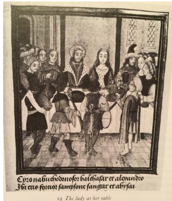
Figure 4: (Power & Postan, 1975)

emphasis on eating, then it can be concluded that this would place a value on women having fuller thighs, stomach, and buttocks. Women of Sparta also ate a great deal, when compared to other Greek states, but they exercised so much that they were not rotund (Pomeroy, 2002). To the right is a depiction of a medieval lady hosting a feast (Power & Postan, 1975). Another difference between the ages was the reasons for families to marry off their daughters. In Sparta a