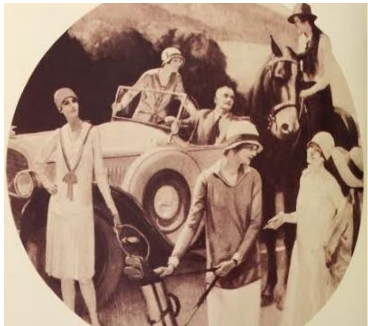
Figure 3: (Ward & Papachristou, 1975)

The woman's ideal body type has changed in the United States, but throughout the 1900's there was an emphasis on slenderization and breast size. In the 1920's the nation moved from a bustier ideal woman to a woman with an almost boyish figure (Mazur, 1986). An example of this is the items sold in the Sears catalog. In 1900 the catalog showcased only wasp-waisted corsets (Mazur, 1986). These corsets accentuated the breasts of the women, but in 1923 the catalog sold only curve-less corsets that suppressed the hips (Mazur, 1986). The dresses hid the complete figure of the woman, excluding her bare legs (Mazur, 1986). All of the undergarments flattened the young women (Mazur, 1986). As show in the picture to the right, the women's outfits concealed their curves, making them appear more boy-like