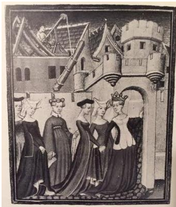
Figure 2: (Power & Postan, 1975)

The women in medieval times were not as valued as those in Sparta. The majority of women in the Medieval Era were considered evil temptresses (Power & Postan, 1975). The women were to be delicate, but society had a great emphasis on food. They believed that eating was the best way to encounter God (Bynum, 1985). Throughout the thirteenth and fourteenth