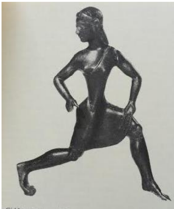
Figure 1: (Pomeroy, 2002)

Women in Sparta were drastically different from the other women in tenth century B.C. Their main purpose in life was to produce sons in order to protect Sparta (Blundell, 1995). The girls were expected to exercise just as much as the boys (Pomeroy, 2002). They believed that this would increase the chances of the woman giving birth to a physically capable baby boy (Pomeroy, 2002). The women continued to run and exercise through their child-bearing years because their slaves did all of the common household work, normally accomplished by the lady of the house (Pomeroy, 2002). Below is a picture of a bronze statuette of a Spartan girl who is