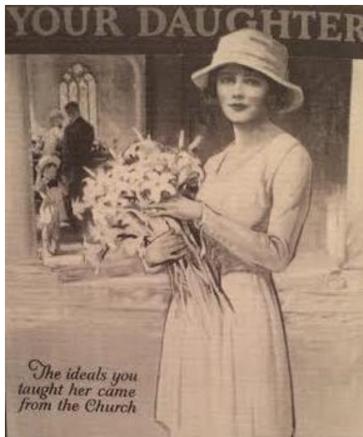
Figure 5: (Brown, 1987)

The most pertinent commonality between the women of the Medieval Era and women in the 1920's was that they placed an emphasis on beauty. Both hid their bodies, either in very large skirts or with shapeless corsets (Mazur, 1986). Women in the 1920's were perceived to be shapeless, whereas Medieval women were form fitted and slender on top, but fuller under their large skirts (Wald & Papachristou, 1975; Power & Postan, 1975). A proper lady living in 1920's did not leave the house without her corset and make-up, much like the ladies of the Medieval Ages (Batchelor, 2002). This is shown in the 1920's advertisement below (Brown, 1987). Men