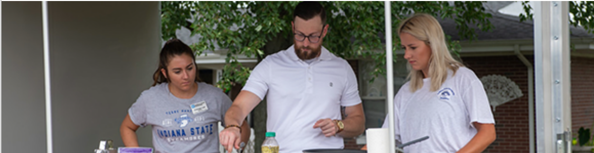
People of State: Dietetics Program